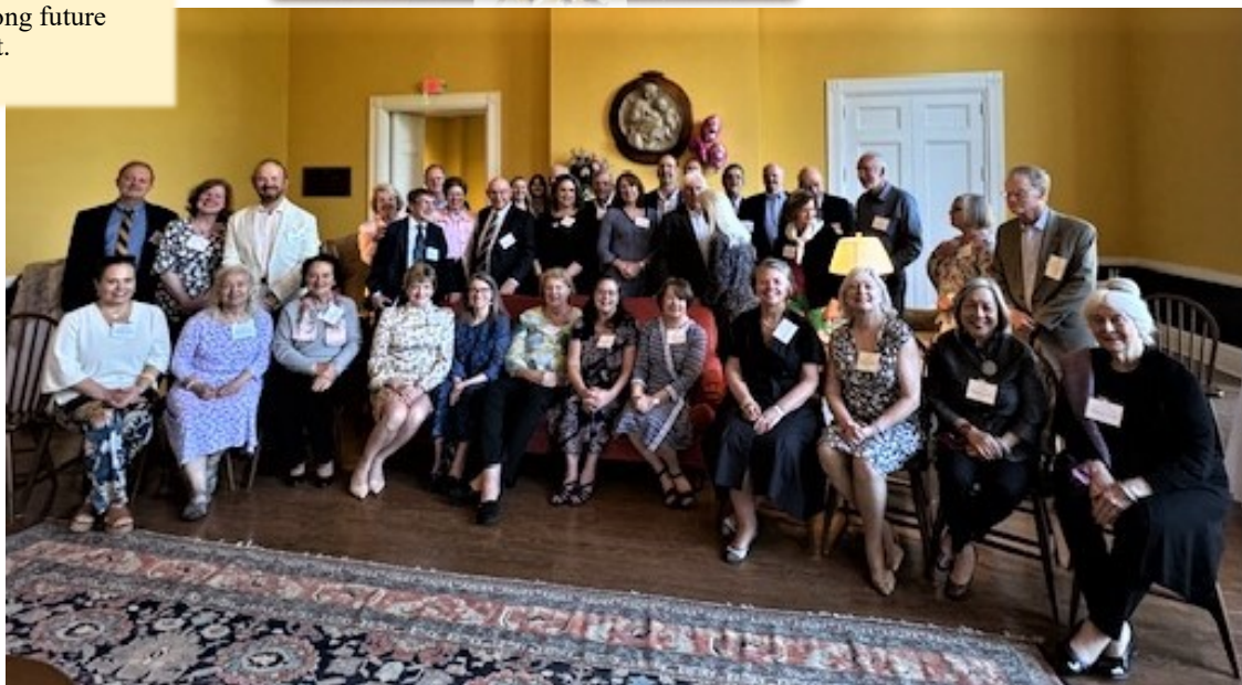
Parishioners gathered for a Festive Reception on April 20, 2024, to thank and honor our Zabriskie Society members who have made a commitment to Immanuel's strong future with a planned gift.