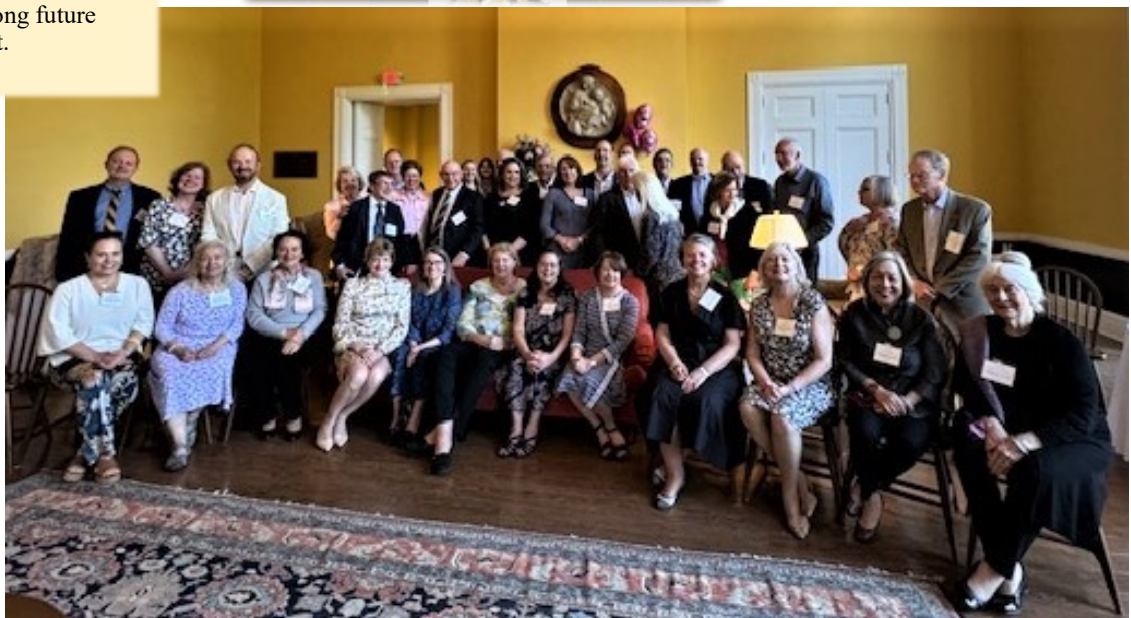
Parishioners gathered for a Festive Reception on April 20, 2024, to thank and honor our Zabriskie Society members who have made a commitment to Immanuel's strong future with a planned gift.